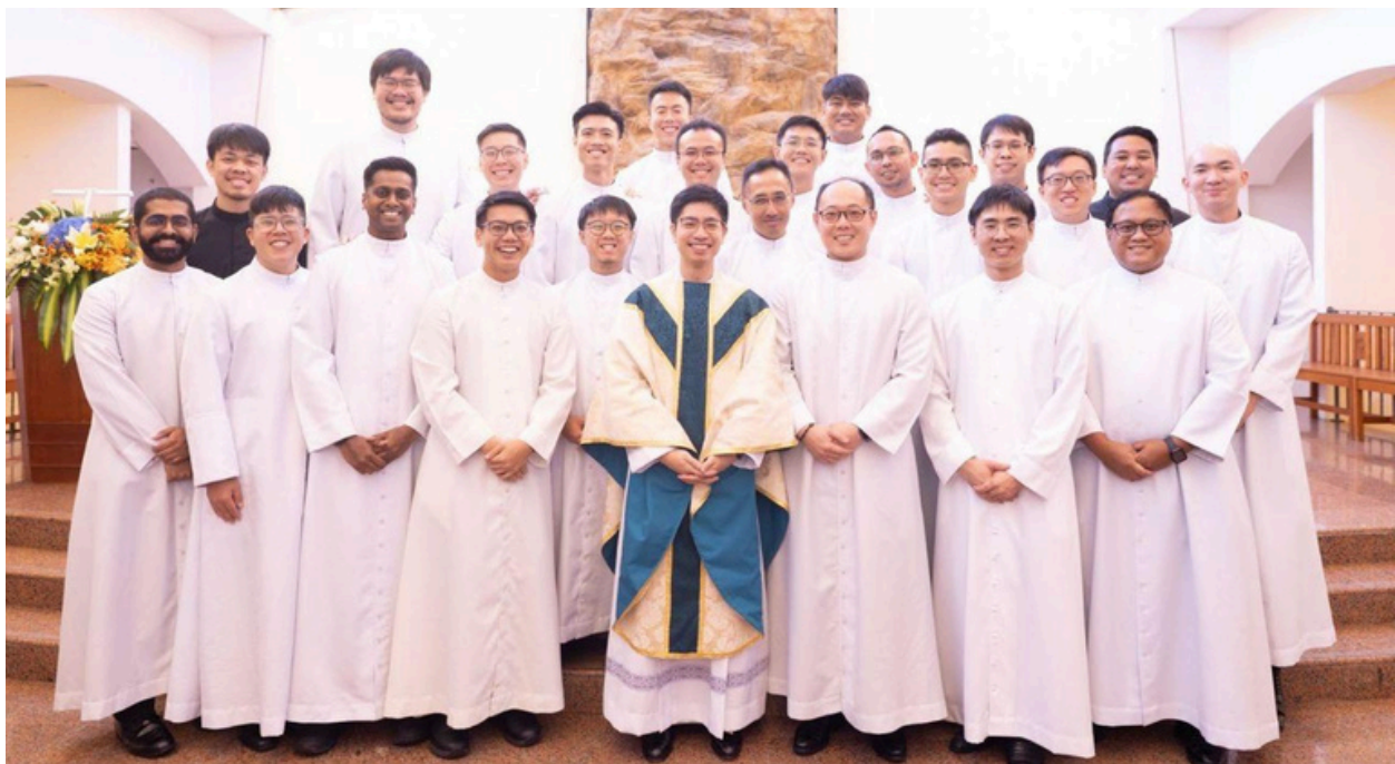
At St Francis Xavier Major Seminary, Singapore

I humbly ask you, dear parishioners, to keep me in your prayers, that I may remain faithful, joyful, and steadfast in my vocation journey, and may the Good Lord bless all of us here in the Apostolic Vicariate of Brunei Darussalam.