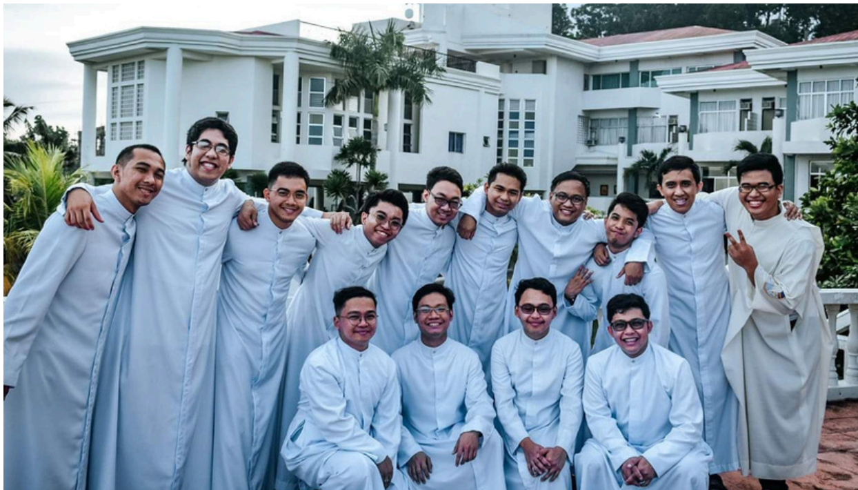
At San Carlos Seminary, Manila, The Philippines

He will next serve in the three parishes of the Vicariate for two months in each rotation, starting with Kuala Belait, followed by Bandar Seri Begawan, and finally in Seria.