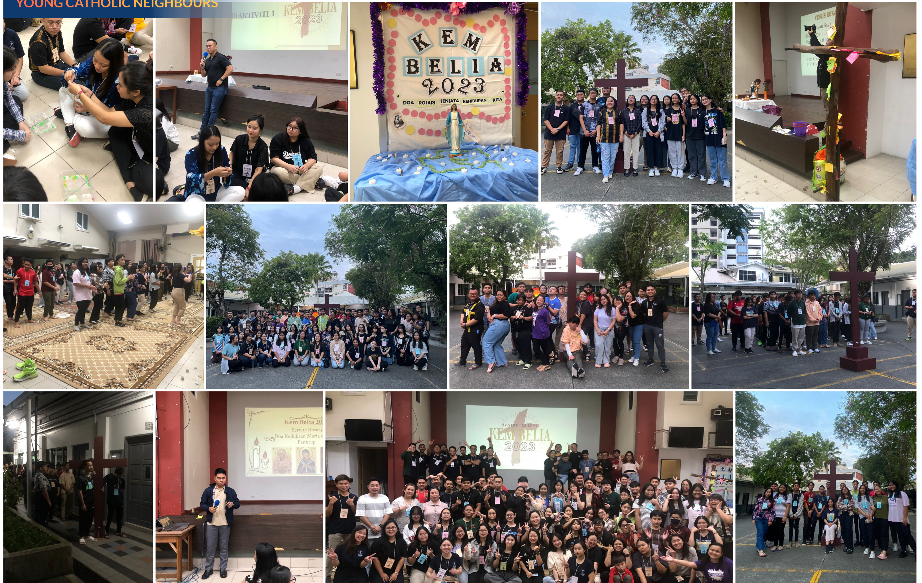
Kem Belia 27-28 September