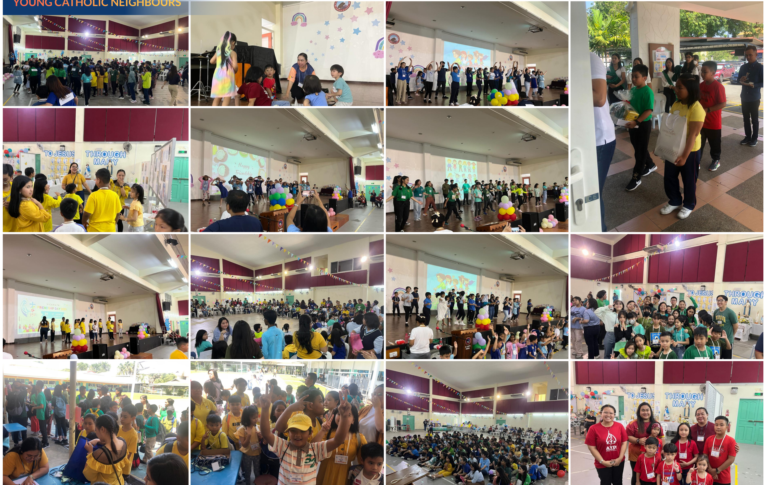
Vicariate Friendship Day 24 September