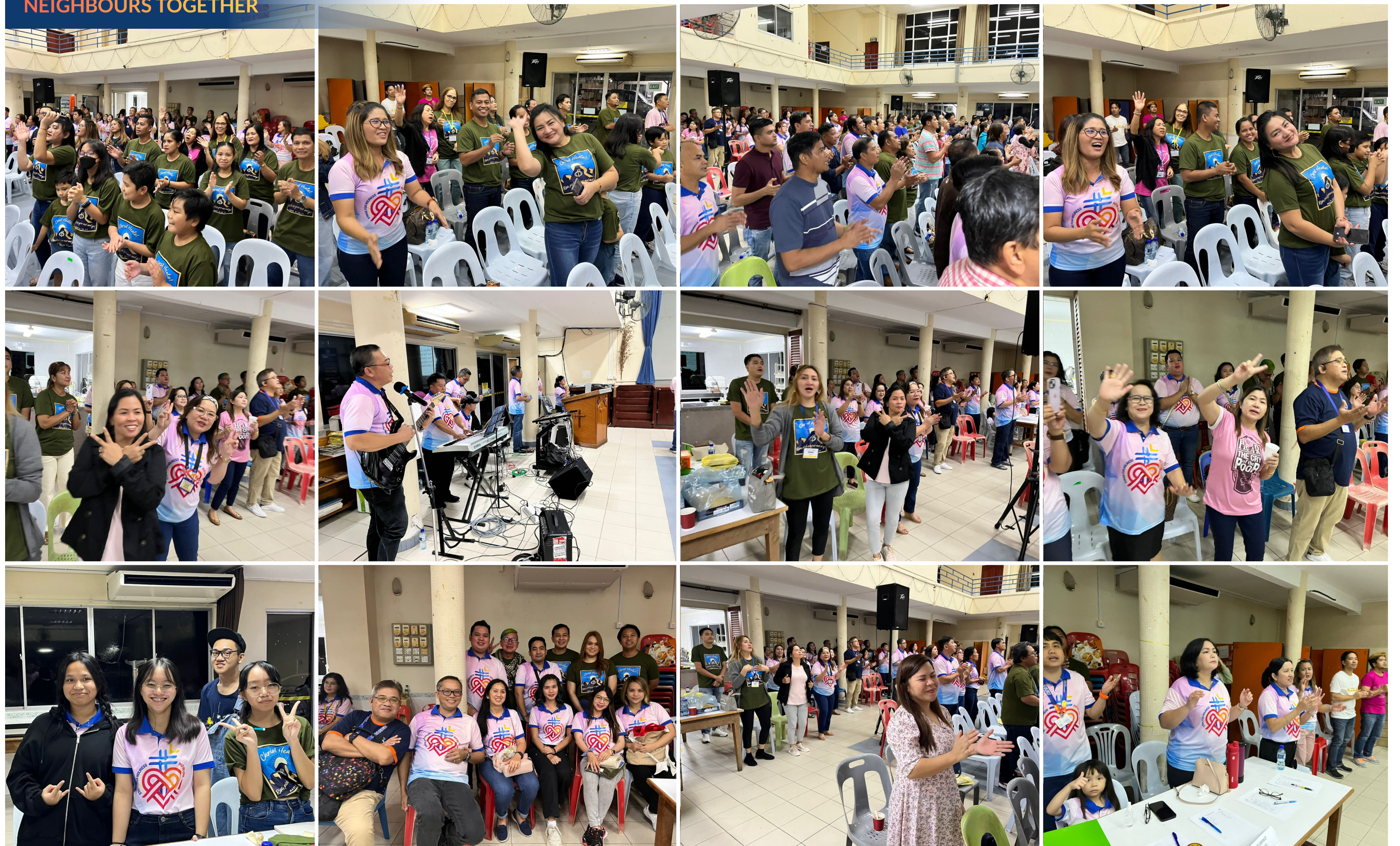
Couples for Christ (CFC) 29th Anniversary General Prayer Assembly 23 September