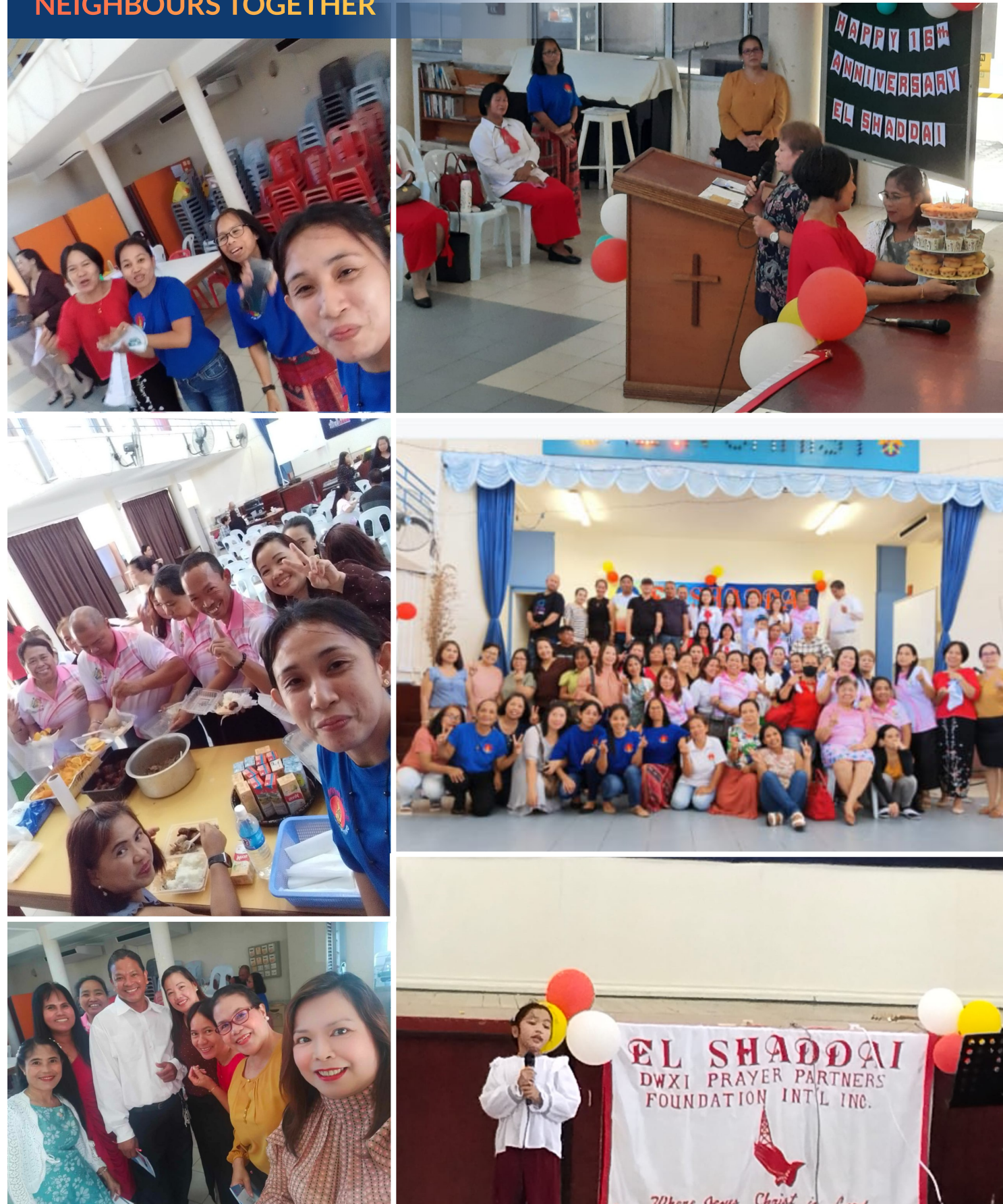
El Shaddai 16th Anniversary Celebrations 10 September