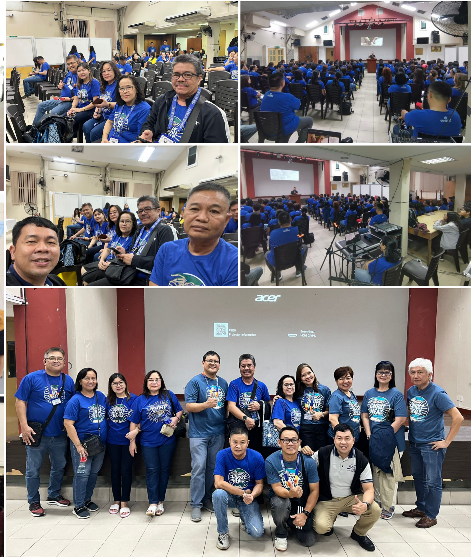
Couples for Christ (CFC) 29th Anniversary Recollection 15 September