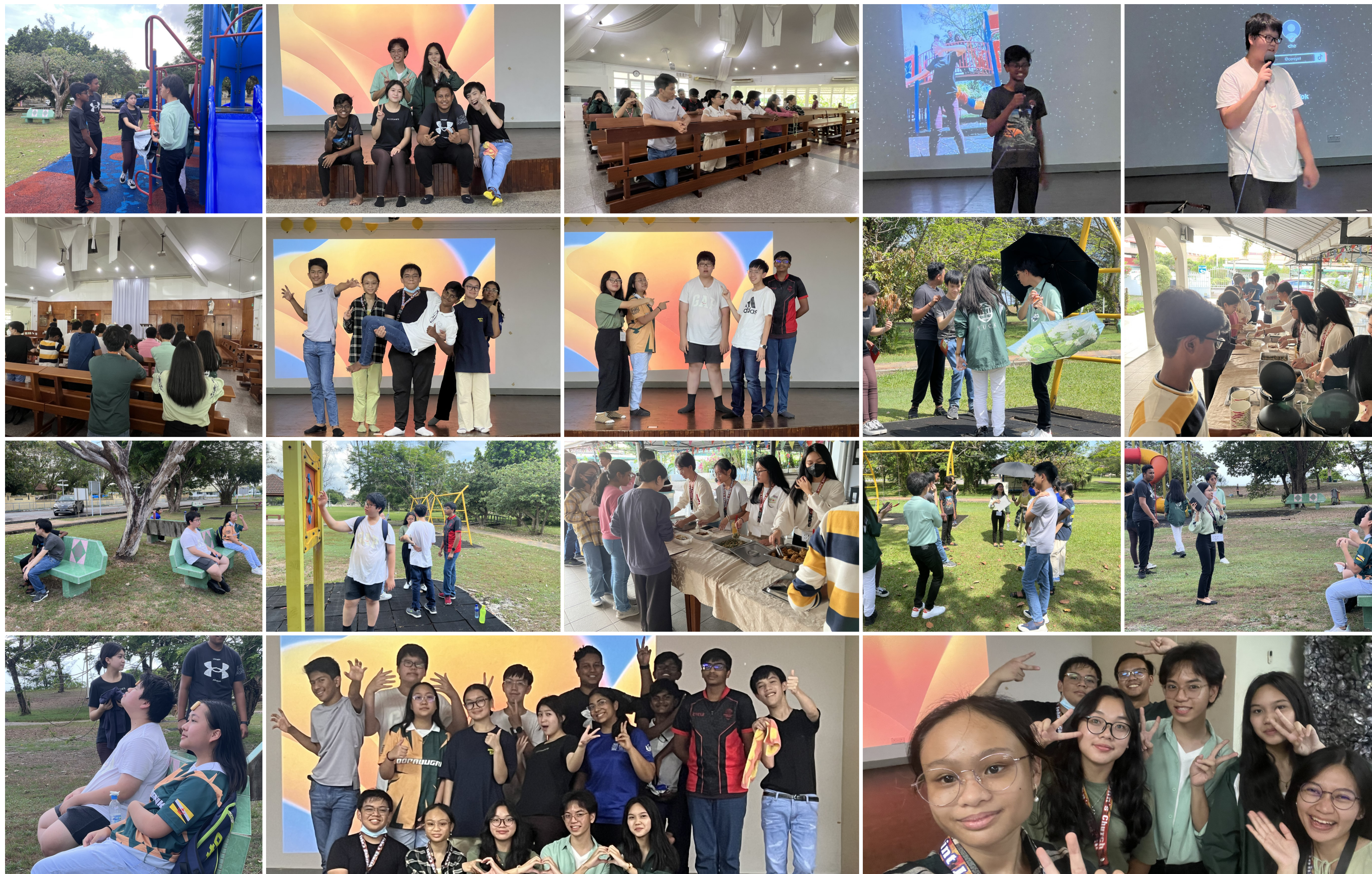
SJC Confirmation Retreat April 2023