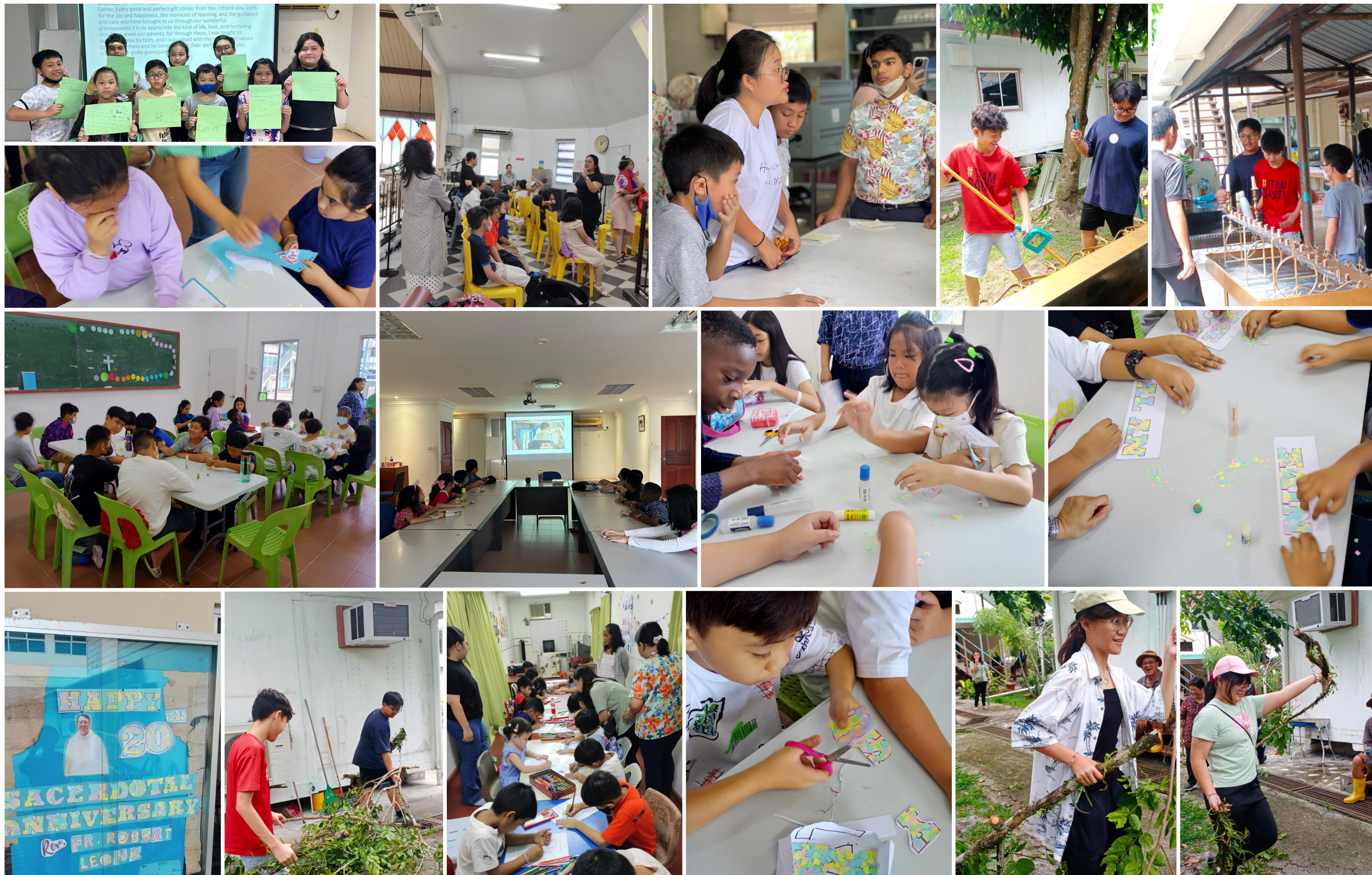
COOL Sunday School Activity Photos 30 July 2023