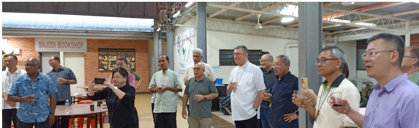
112th Plenary Meeting of Bishops Conference of Malaysia - Singapore - Brunei 10th -14th July, Majodi Centre, Malaysia