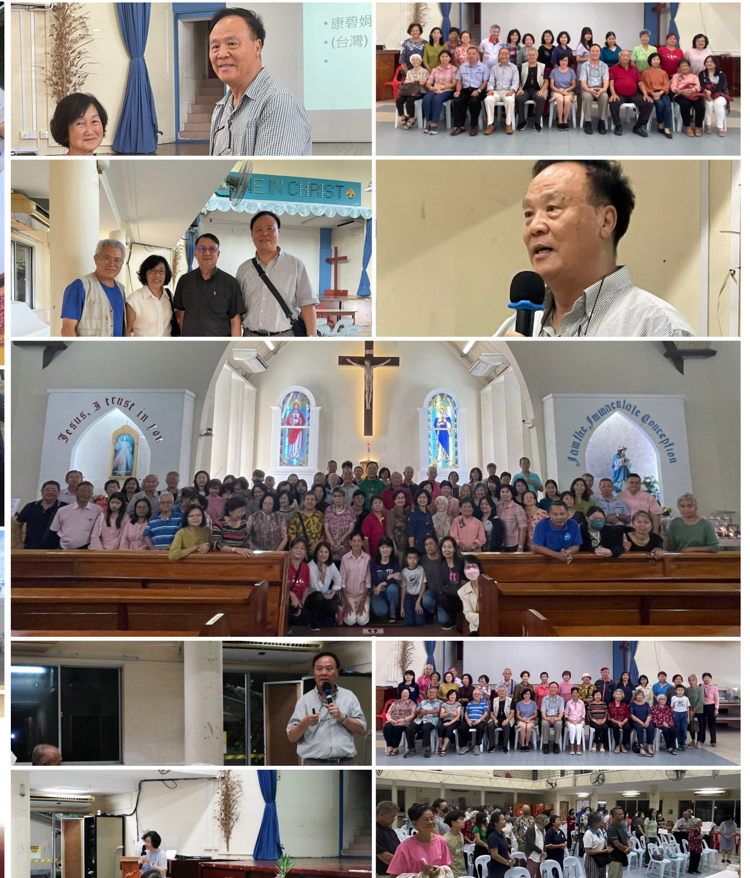
Talk on Spirituality of St Therese of Lisieux in Mandarin July 2023