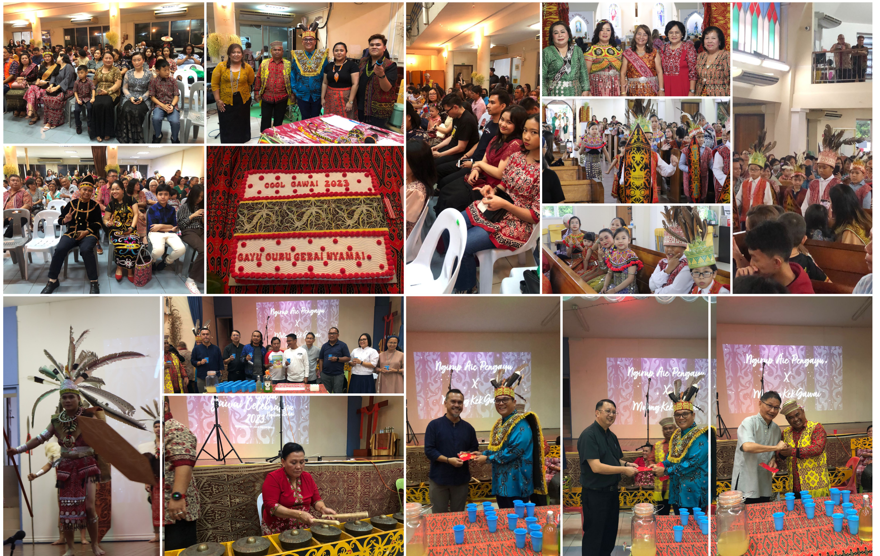
Vicariate Gawai Celebration 1 July 2023