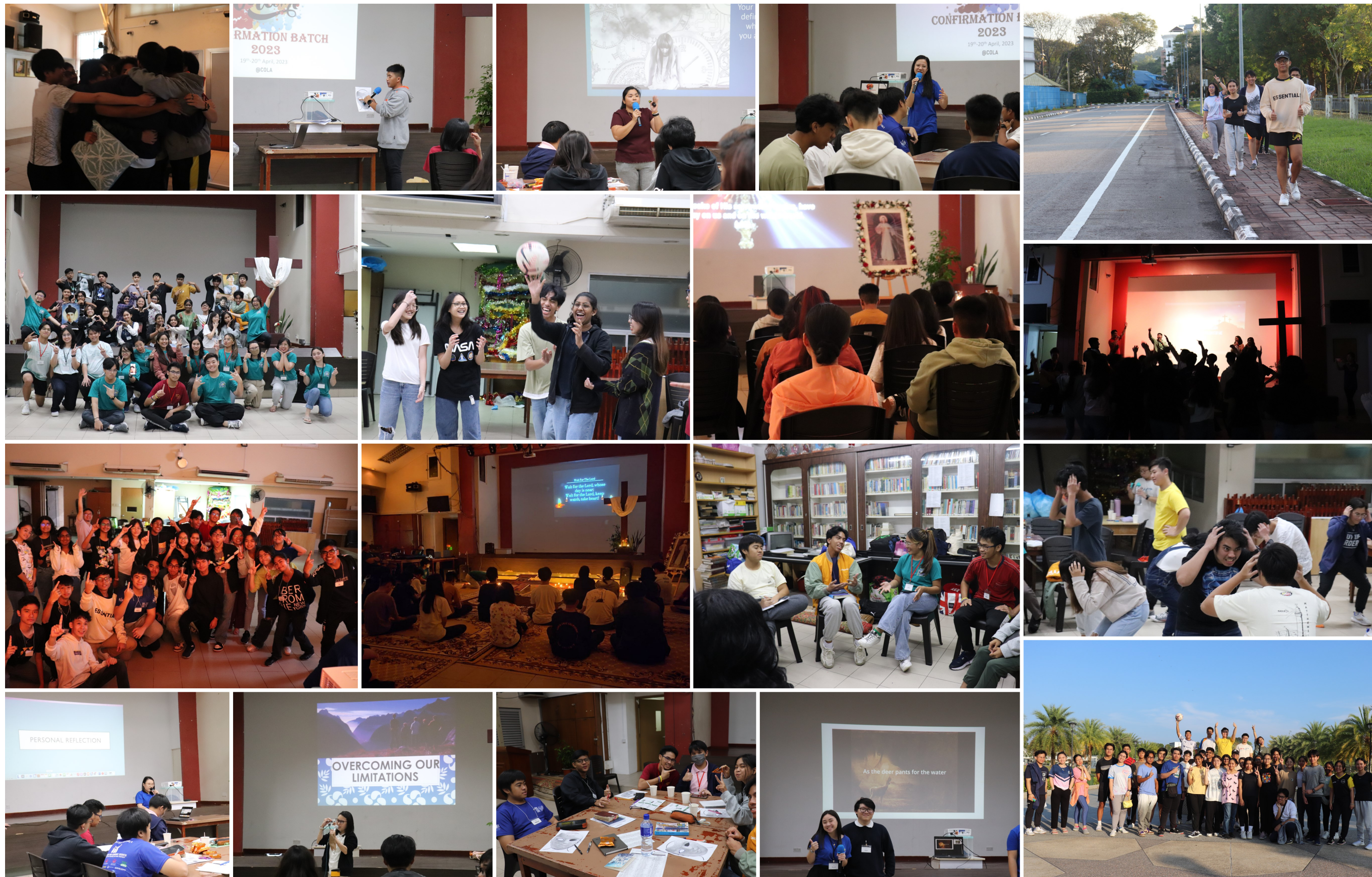
COLA Confirmation Retreat 19-20 April 2023