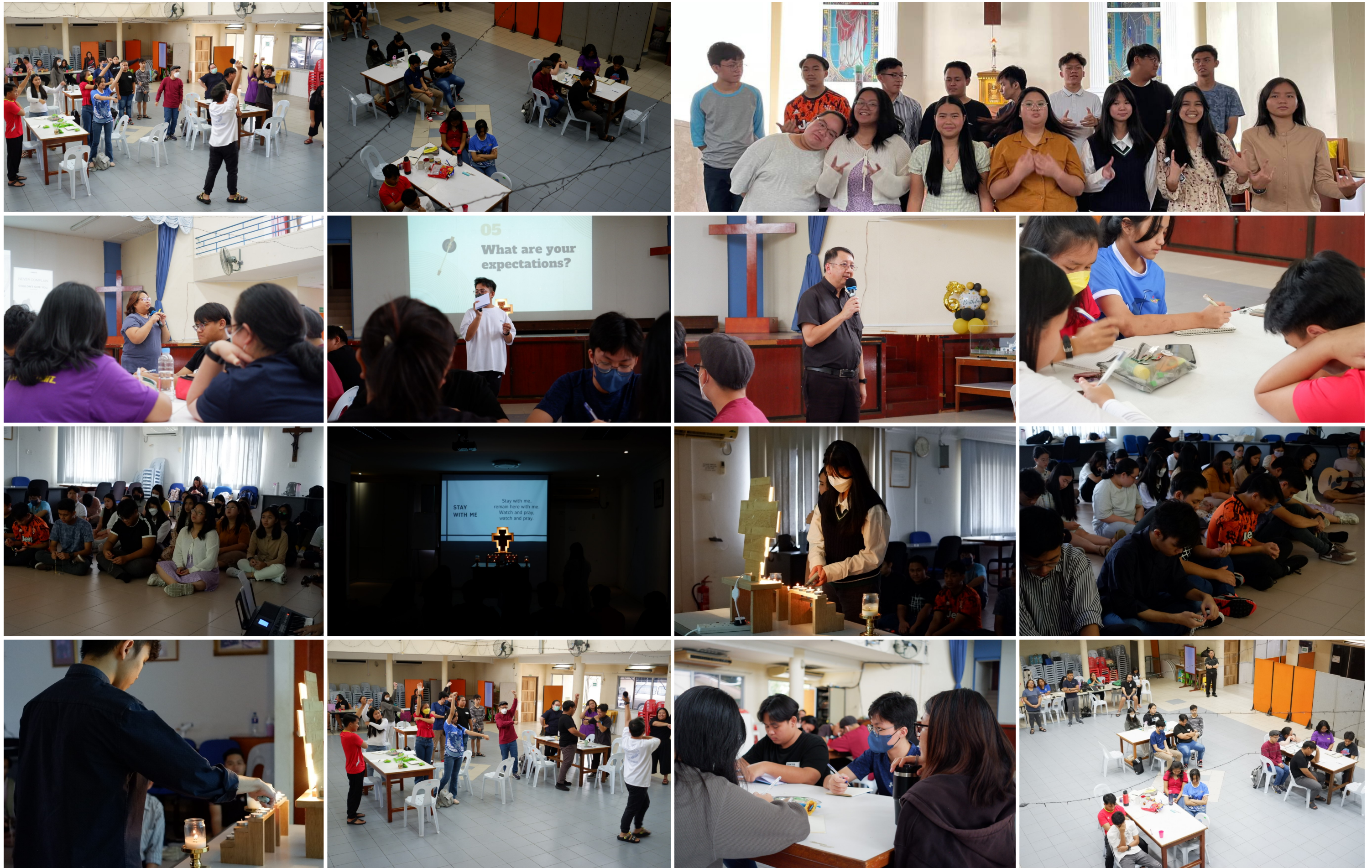
COOL Confirmation Retreat 13-14 May 2023