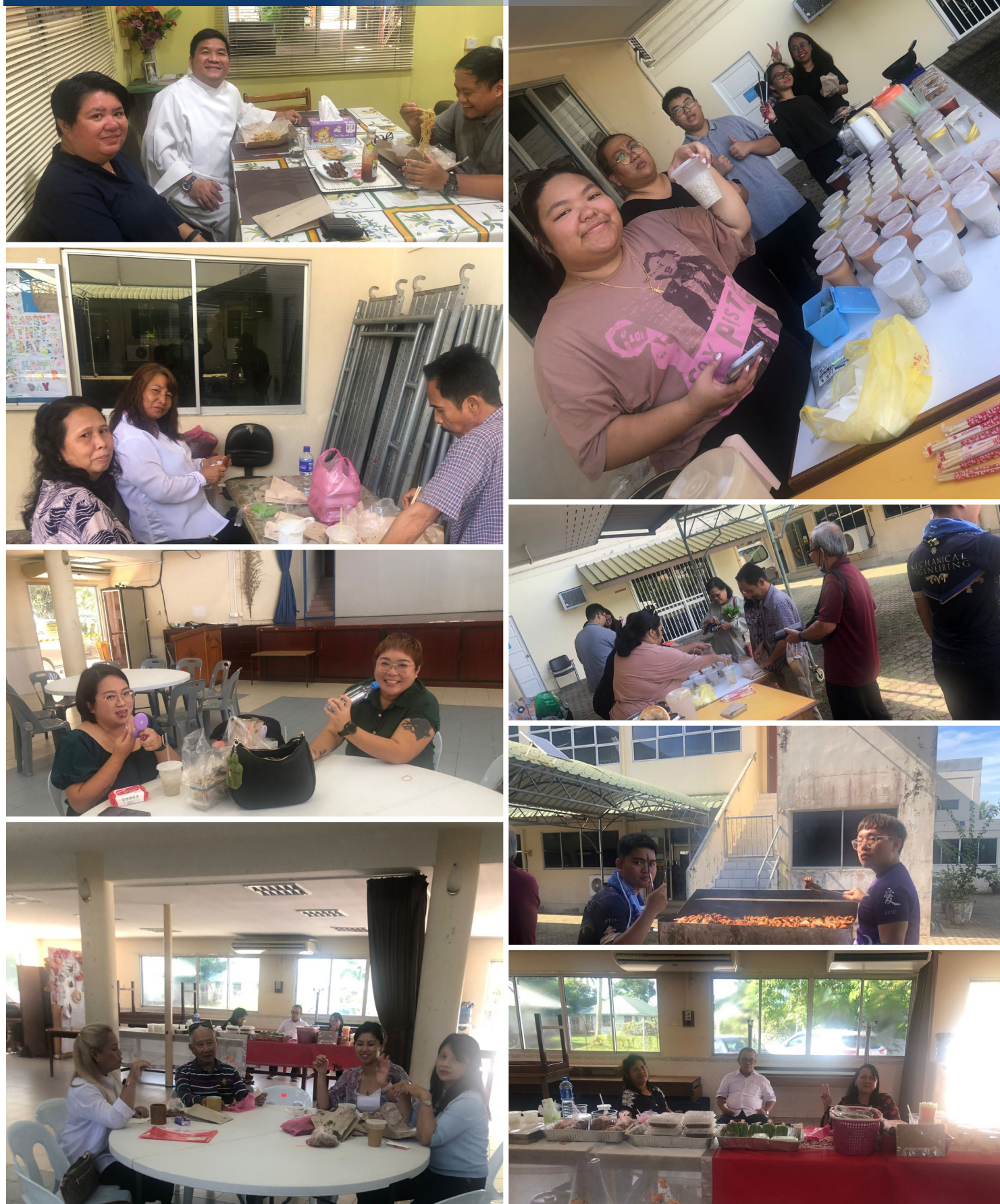
COOL Youth & Iban Groups Breakfast Sale 9 July 2023