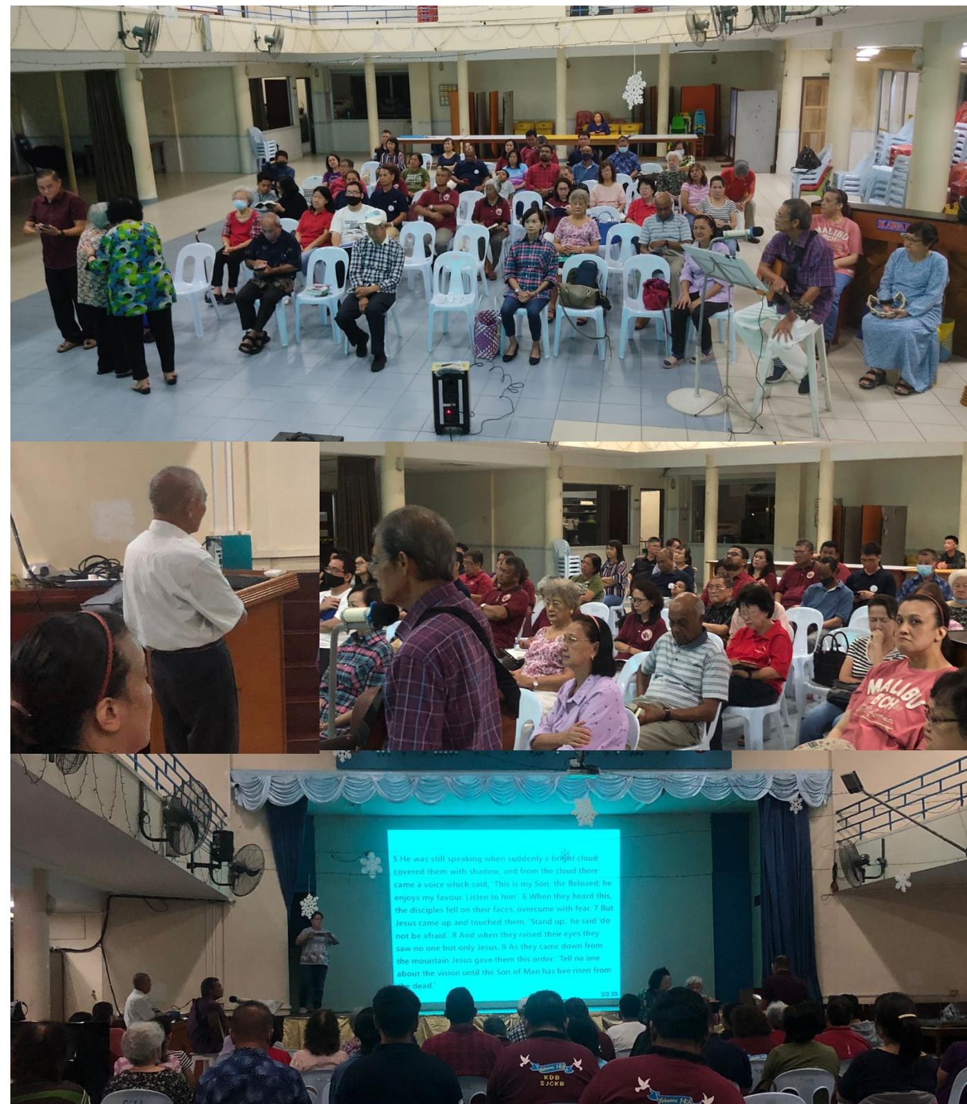
COOL & SJC English & Chinese Prayer Meeting (27 February)

"A welcome for the traveler New wine for the vineyard"