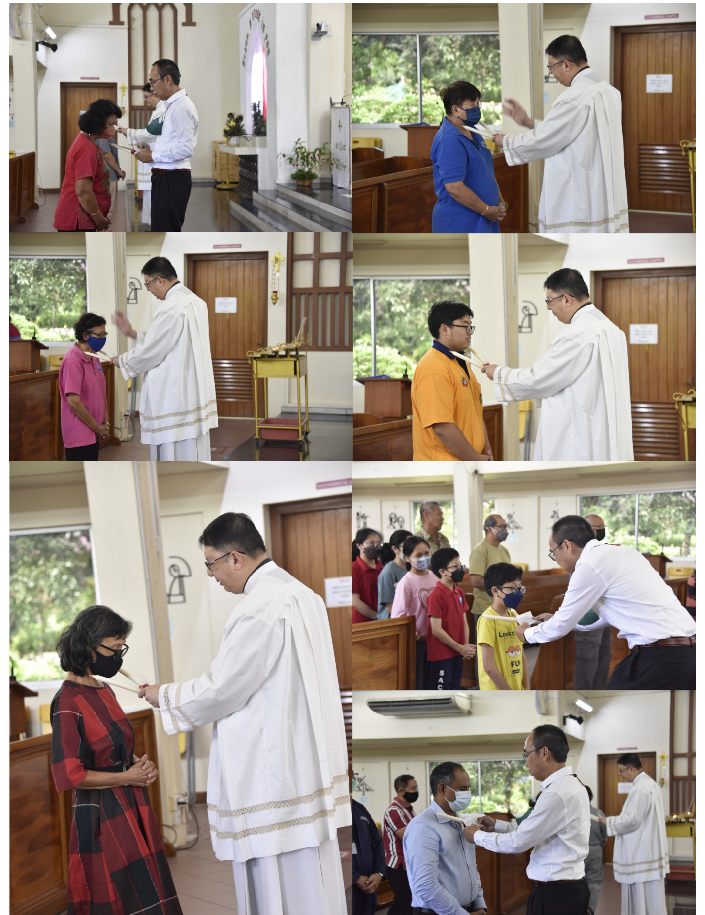
COOL Blessing of Throats, Feast Day of St Blaise (3 February)