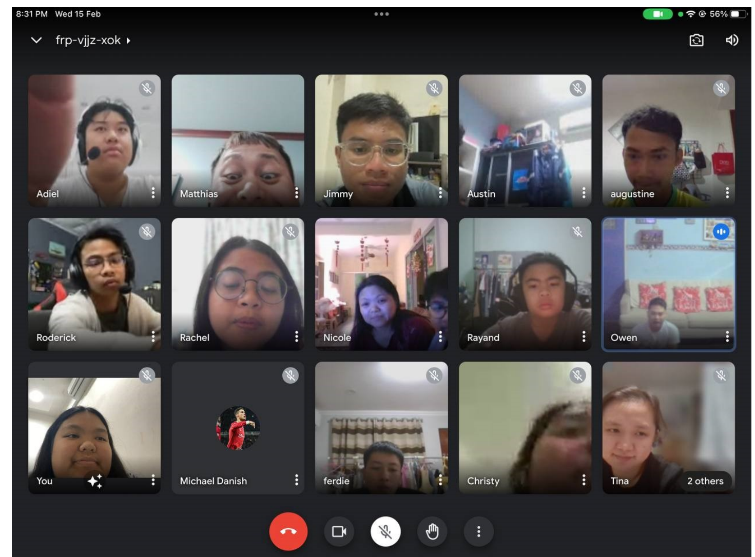
COOL Youth Rosary for Earthquake Victims (15 February)