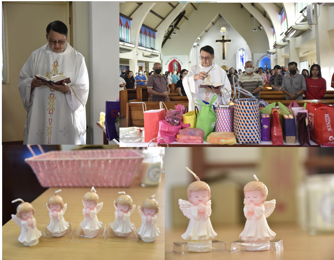
COOL Blessing of Candles, Presentation of the Lord (2 February)