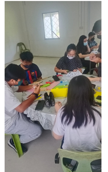
COOL Sunday School Monthly Activity (26 February)