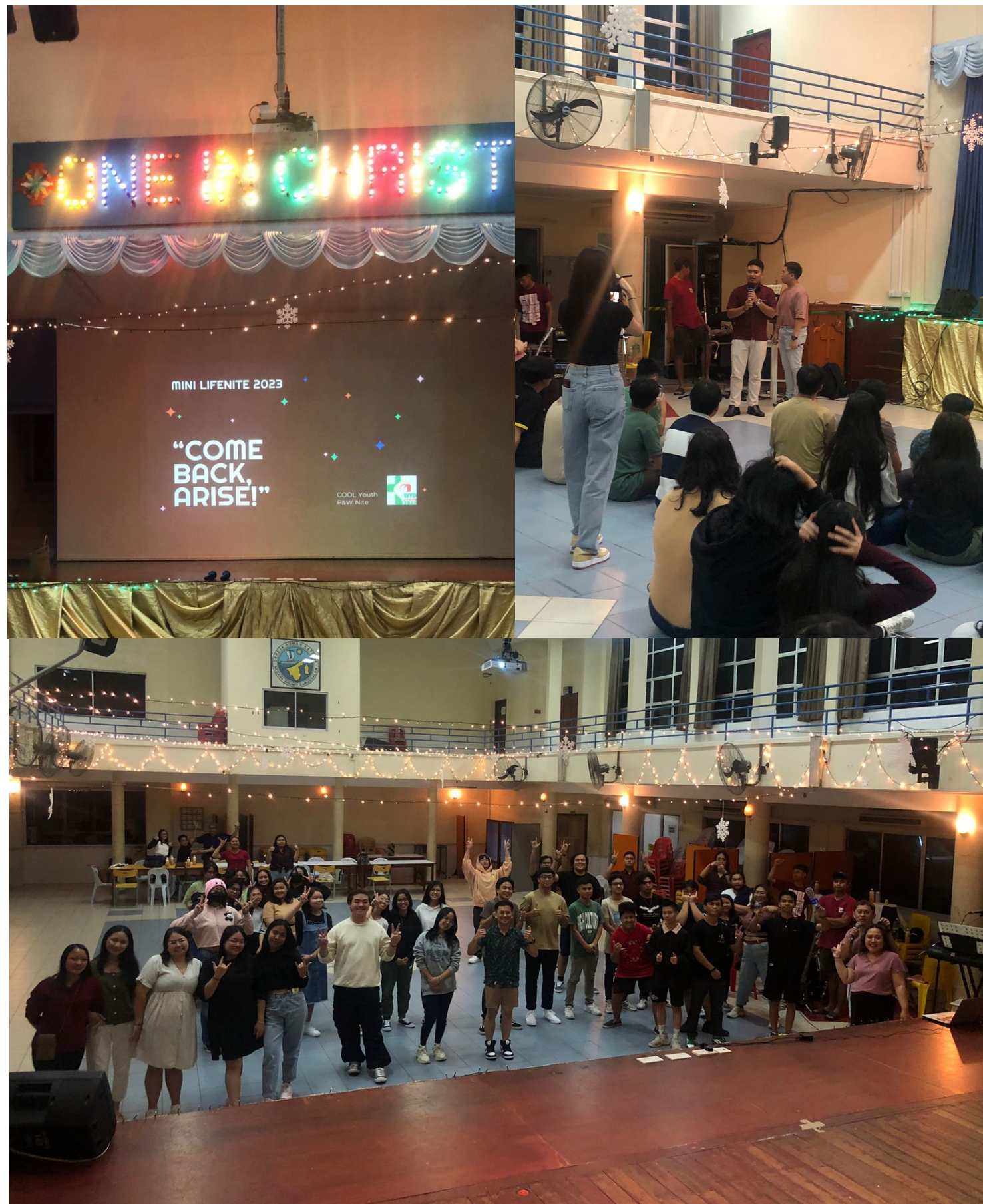
COOL Youth Praise & Worship (4 February)

"Love has a bigger table Show me who is my neighbor The Christ hidden in the beggar"