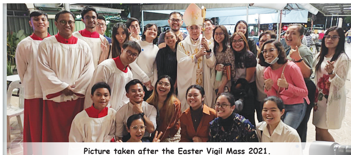
Picture taken after the Easter Vigil Mass 2021.