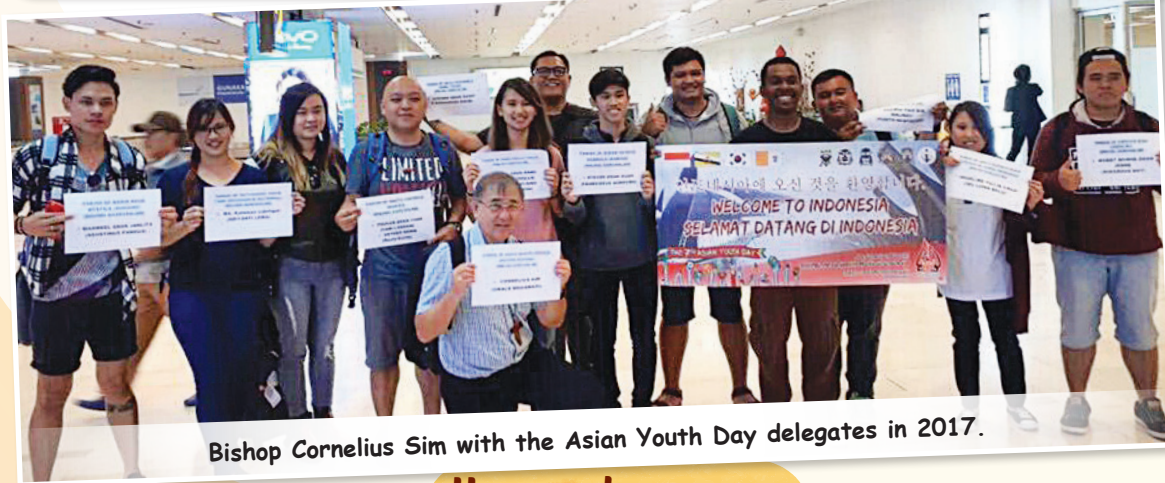
Bishop Cornelius Sim with the Asian Youth Day delegates in 2017.