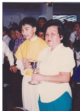
His mother bringing the offertory during his priestly ordination.