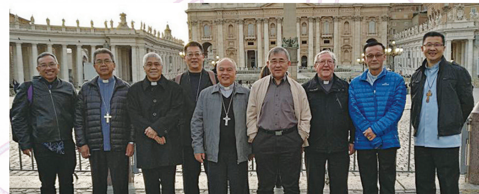
Catholic Bishops' Conference of Malaysia, Singapore and Brunei's Ad Limina visit in Rome from Feb 4 - 9, 2018.

"Thus, I willingly join the priests and the lay faithful to thank God for his life and the generous services rendered to the Apostolic Vicariate of Brunei Darussalam. We pray for God's peace and comfort at