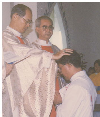
Priestly Ordination, November 26, 1989.